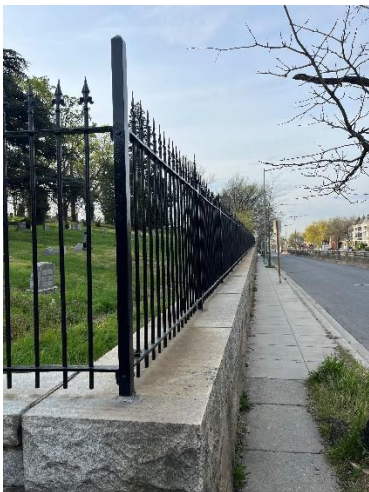
Looking South from Bryant Street Street

In the fall of 2023 the cemetery received two bequests totaling nearly $80,000. The board asked superintendent Connell to obtain pricing on painting the fence along North Capitol Street, which is about 1,000 feet long. The specifications called for sand blasting the wrought iron fence down to bare metal, and applying primer and finish coats using Rustoleum products. The proposed cost was $15,000 which the board approved. The work was done in April 2024 by R & R Tree Services. The following pictures show the result.