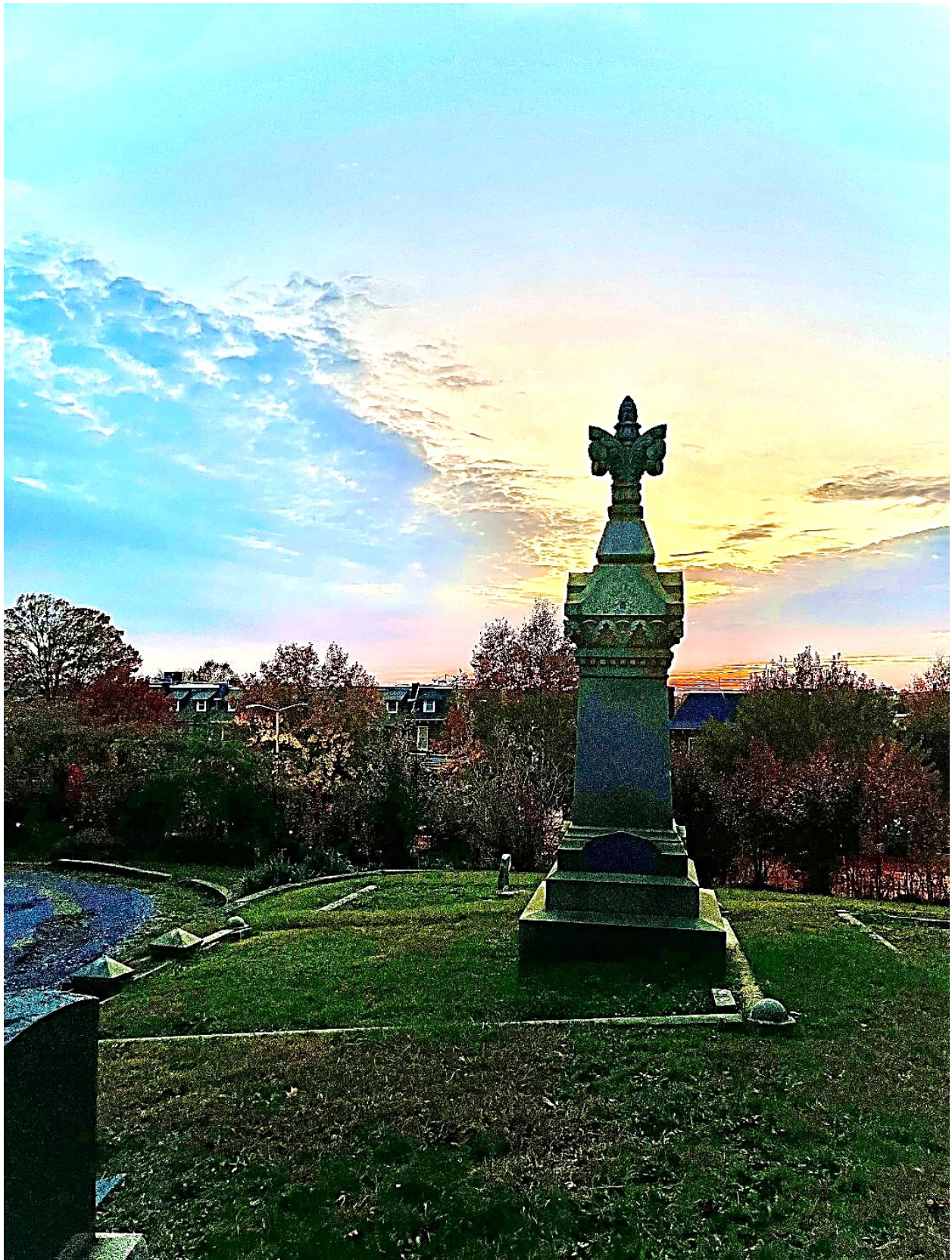
SUNSET AT PROSPECT HILL