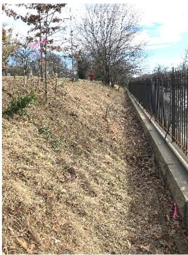
After initial clearing