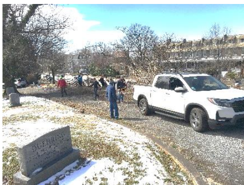
The whole crew