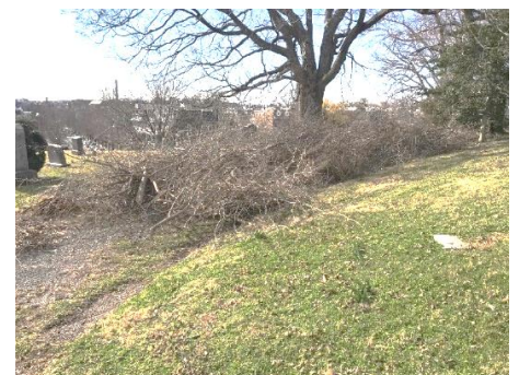
The Brush pile The remains of the day