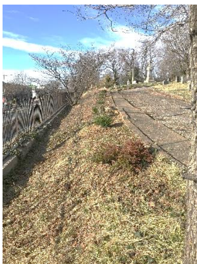
The final result