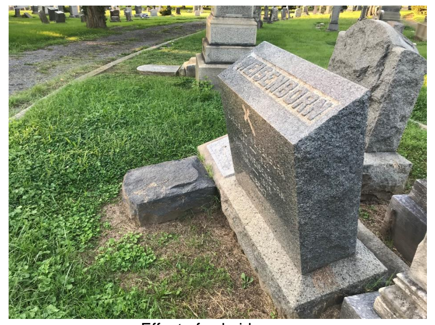
Effect of subsidence