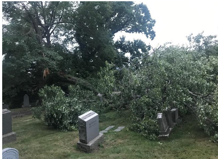
Large branch broke off and engulfed tombstones. Fortunately, none were damaged.