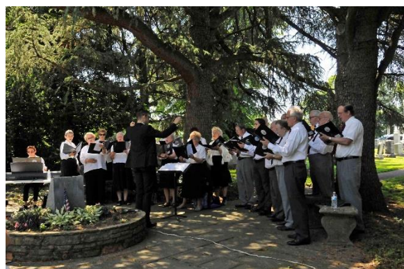
The Washington Saengerbund

The Saengerbund sang the prelude: a setting of Psalm 23 by Johann Sebastian Bach – "Gutes und die Barmherzigkeit" from Cantata BWV 112, "Der Herr is mein getreuer Hirt."