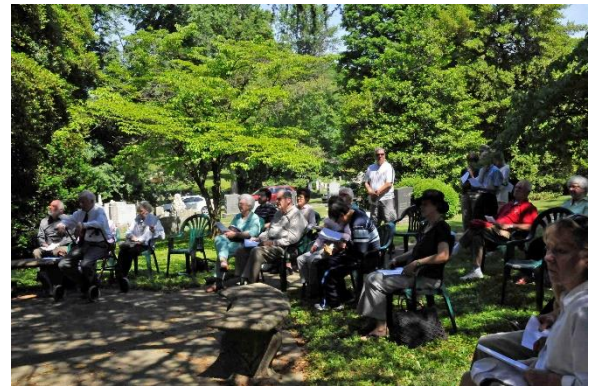
Attendees at the service

The Saengerbund sang the beloved hymn "So nimm denn meine Haende" by Friedrich Silcher.