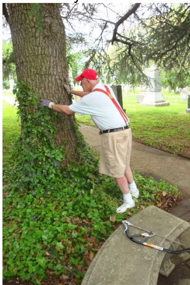
Clearing poison ivy

Refreshments and snacks were provided for all to enjoy. The weather was perfect for working at the cemetery.