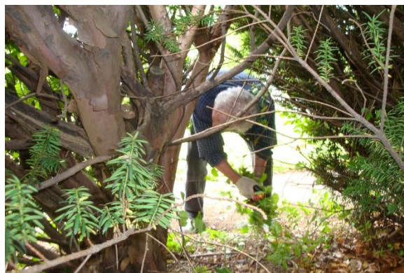
Really getting into the work