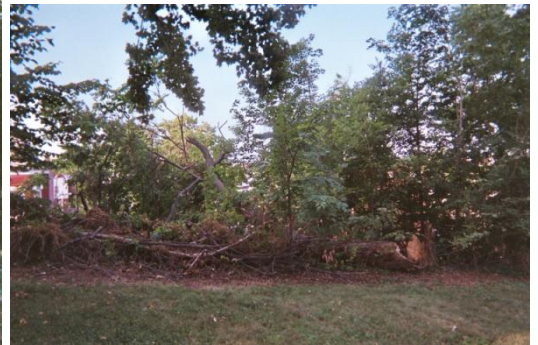
Fallen Tree in Section L above V Street