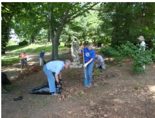
Cleaning up the Memorial Garden