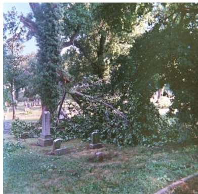
Storm damage in Section D