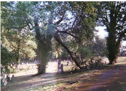
Storm damage in Section D

Early in the morning of June 30, 2012, Superintendent Joe Connell was awakened to howling winds, crashing thunder, flashing lightning, thrashing trees, and tree limbs falling everywhere. The severe storms that swept across the eastern seaboard that night had struck Prospect Hill too. Power was out for the entire next day, fortunately not as long as in many other parts of the country. Connell contacted R & R Tree Service of Silver Spring, MD and they arrived within a few hours. They worked all day on June 30 and July 1 cutting up the fallen limbs and cleaning up debris, at a cost of $3,500. Remarkably, no tombstones were damaged and the new roof performed as designed.