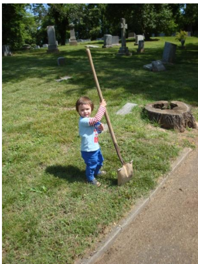
Young volunteer lending a helping hand

Refreshments and snacks were provided for all to enjoy. The weather was perfect for working at the cemetery.