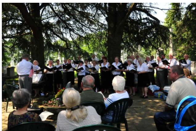
Guests enjoy Saengerbund performance