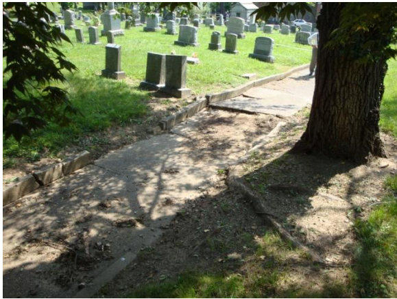
Sidewalk between Sections E & I damaged by tree roots

There is always something to fix at the cemetery. Last year the lower end of the concrete sidewalk leading from the house to the Memorial Garden was reworked. That same sidewalk needs additional work. A section about halfway along it has been lifted by large tree roots, creating a dangerous tripping hazard. And the steps at the top of the sidewalk have irregular step heights, making climbing them somewhat tricky. Finally, the sidewalk leading across the cemetery from the aforementioned steps to the center roadway also has several sections which have been lifted by tree roots.