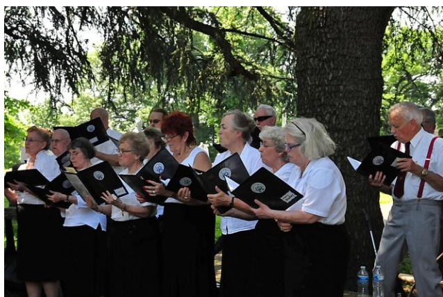
Saengerbund performs during service