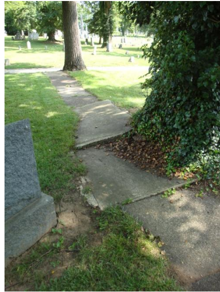
Sidewalk in Section E damaged by tree roots

The cost to rework and repair these areas is estimated to be $3,500. We hope to accomplish the work this year.