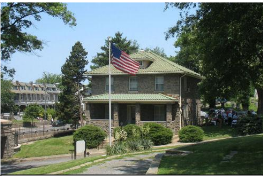
Gatehouse with new Roof

Over a year ago, planning for replacement of the roof on the Old Gatehouse at the entrance of Prospect Hill was started. As described in the 2011 Holiday Issue of our newsletter, the process involved many steps which ultimately resulted in the awarding of a contract to Wagner Roofing Co. of Hyattsville, MD, to remove and reinstall the existing tiles, remove and replace the underlayment and flashing, damaged sheathing and rafters, all wood soffits and fascia boards, and all gutters and downspouts. Thanks to generous lot owners, painting of all the remaining woodwork and all security grilles and iron railings on the building at windows and doors was added to the scope of work to provide a complete refreshing of the building.