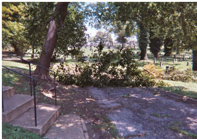
Large Bradford Pear branch blocks roadway between Sections M & I.