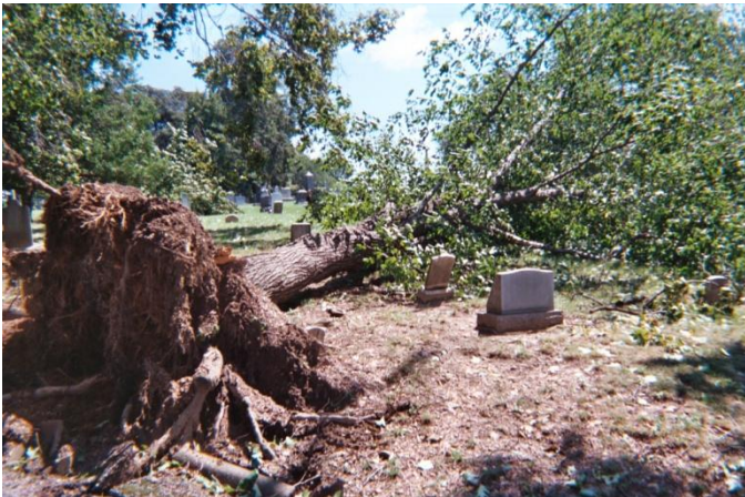
Large poplar tree completely uprooted in Section D along center roadway

Before the hurricane hit, Connell had contacted the reliable R & R Tree Service of Silver Spring requesting our cemetery be first on their schedule for service after the storm which was on a Saturday. R & R was there Sunday afternoon. A return trip Monday had everything cleaned up by mid-day. A few days later R & R returned again to grind the stumps. A job well done!