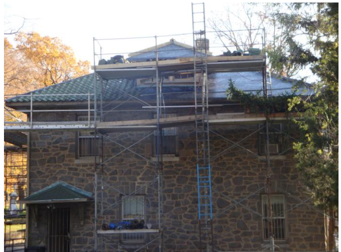
Tiles removed from north side gable roof and portion of the main roof; new underlayment installed