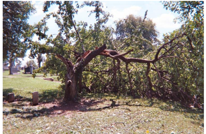
Tree crabapple tree split right down the middle in Section D