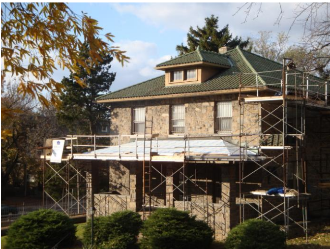
Tiles removed from front porch and new underlayment installed

After the roofing project has been completed, repair of water-damaged ceilings will be undertaken, and the exterior of windows, doors and their frames will be painted.