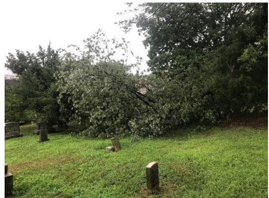
In Section H