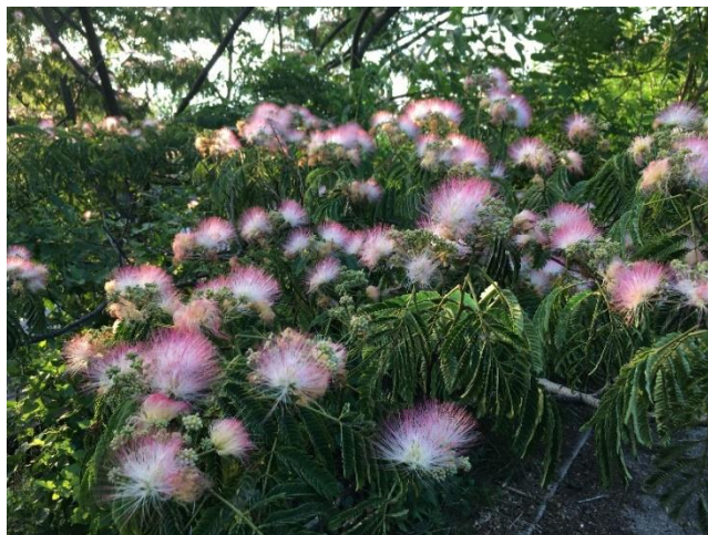
Mimosa in bloom on cemetery grounds