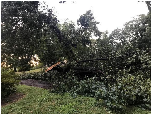
On the road between Sections M & I