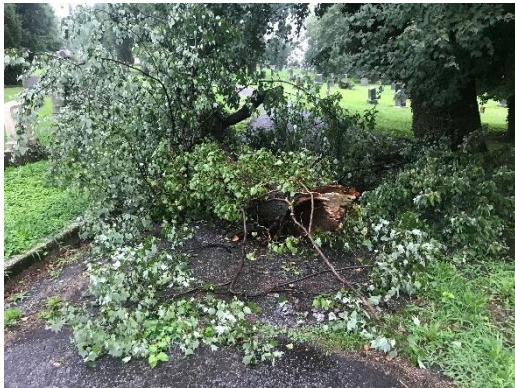
On the road between Sections Circle R & D South

Through the rest of July and early August, several more trees and large branches came down during storms as shown on the following images.