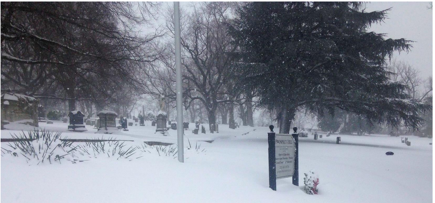
Snowstorm at Prospect Hill January 23, 2016